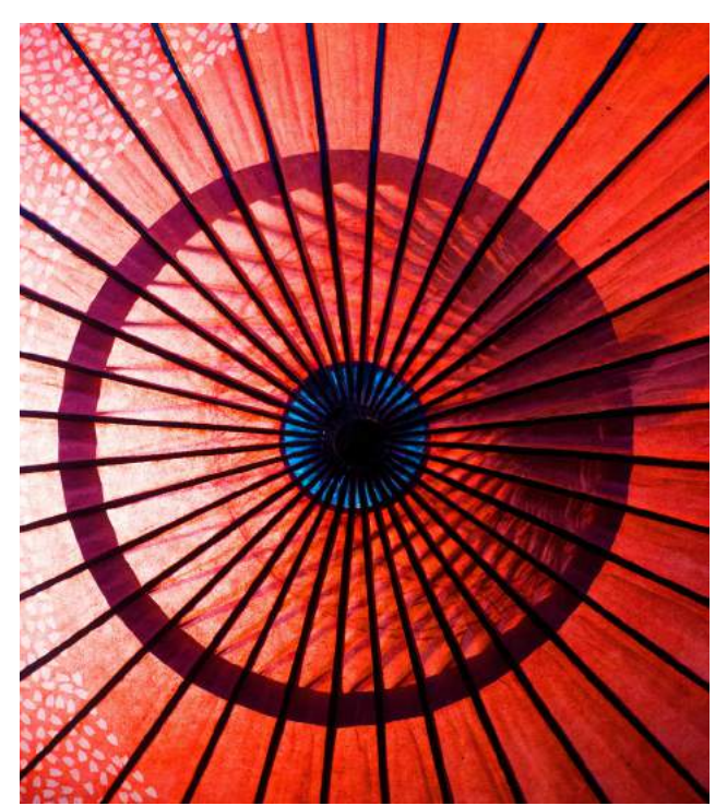
by an abundance of water and forest. Much of DōMatcha's® organic matcha is cultivated here.

No chemical fertilizers, herbicides, or pesticides are used. The tea fields are surrounded by trees and bush to protect the fields from environmental contaminants. Each batch is tested for chemical and bacterial residue. Sensory testing, color and tone testing, and nutritional ingredient analysis are also performed on every batch.